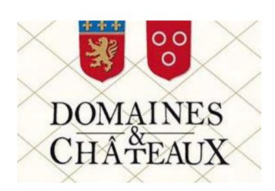
Burgundy FRANCE A Family of Winemakers