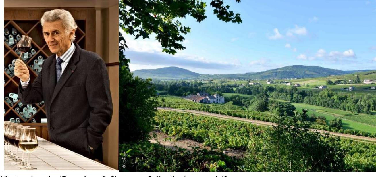
What makes the 'Domaines & Chateaux Collection' so special?

The Domaines & Chateaux collection represents single-estate and even single-vineyard wines that are produced by independent vignerons and available to the US market exclusively through Quintessential. These wines come from some of the very best family-owned estates and producers located throughout the Beaujolais region.